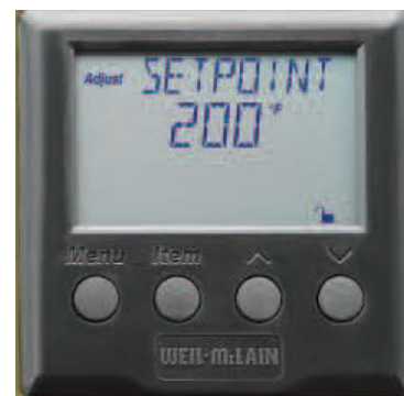
Set Point Operation