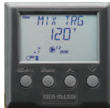
Low Temperature Mixing